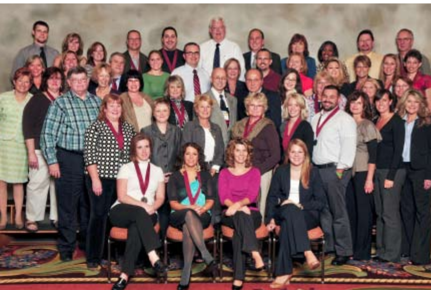
Michigan hospital and transplant center representatives and the Michigan Health & Hospital Association join Gift of Life Michigan at the Fifth Annual National Learning Congress on Organ Donation and Transplantation in Grapevine, Texas.

Of the roughly 3,000 hospitals nationwide, 430 earned Medals of Honor for some level of achievement. Sixty hospitals in the same size category as Munson received silver or bronze medals. It stands alone with gold.